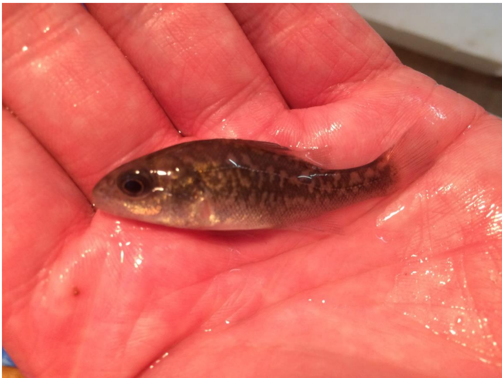
Macquarie Perch fingerling held in the NFA (Vic) hatchery

We hope to get another batch of fingerlings from the VFA in the next few weeks and replicate last year's trials.